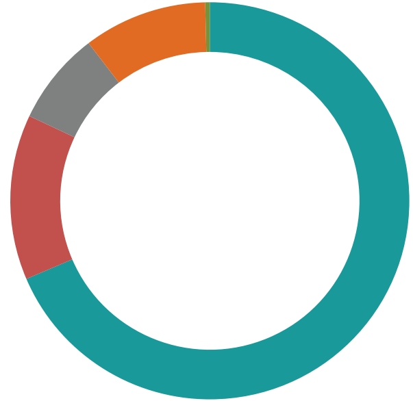
Revenues 2021-22 through 3/31/22

Plans call for Cooperating School Districts to again turn to Marr and Company for the 2022-23 audit.